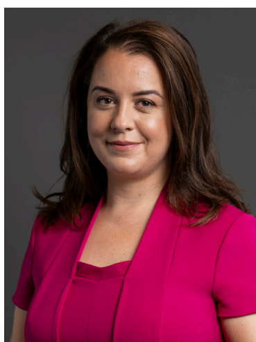
Stephanie Peacock MP Minister for Sport, Media, Civil Society and Youth

Thank you for your commitment to supporting charitable giving and for using this guide to enhance your organisation's efforts.